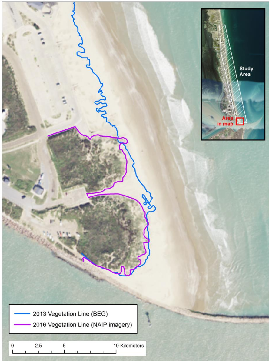
Figure 2. Changes to the vegetation line from 2013 to 2016 in the area of SPI adjacent to the Brazos Santiago Pass show substantial loss of vegetation due to human activities.

In addition to the analysis of elevation change using lidar, we also began evaluating changes to the vegetation line. Using National Aerial Imagery Program aerial photos from 2016, we digitized the vegetation line. Figure 2 shows the 2016 line as compared to the vegetation line obtained from BEG from 2013 for the same area shown in Figure 1. There was substantial retreat of the vegetation line in this area, primarily due to human modifications in the form of creating non-elevated beach walkways, and eradication of the dunes for the creation of recreational areas. Both of these types of activities result in increased vulnerability to storm waves.