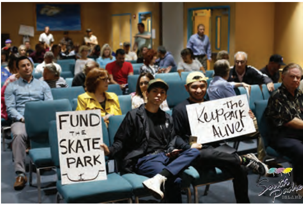
Skatepark supporters at City Council meeting.