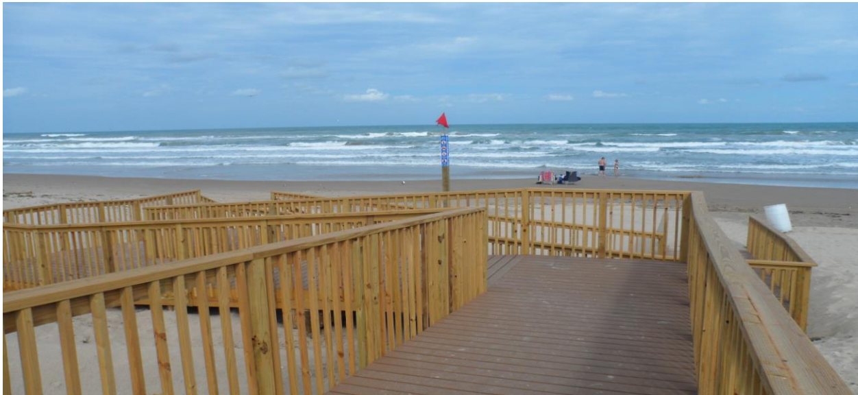
Aquarius Circle Walkover