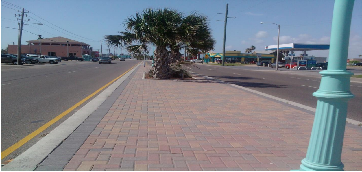
Padre Boulevard Medians