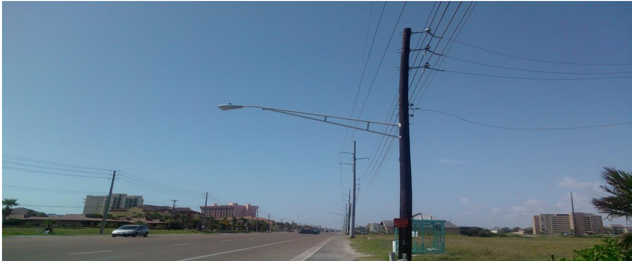
14' Arm with 250 HPS Lighting

Those existing lights that have identified as inadequate are being identified for upgrade to include more powerful and more efficient lighting as well as longer arms that will allow the light to be directed near the center of the street. This upgrade of the existing lighting will cost approximately $ 600 per light.