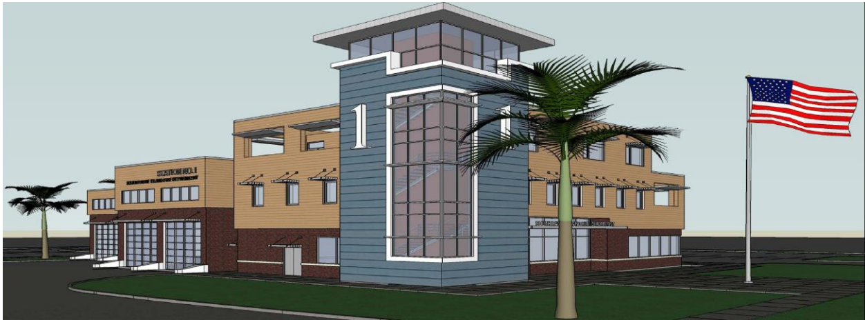
Proposed Fire Station