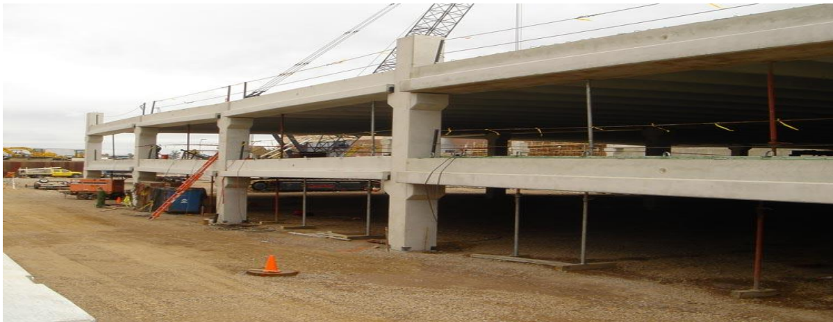
Example of Parking Structure

Creation of a multi-modal facility serving the basic function of parking vehicles as well as designed to incorporate multi-use features including residential and/or commercial development. The structure would facilitate visitors and/or residents transition to and from their vehicle. Users of the facility need access to the beach benefitting local business and increase use of public transportation. The facility could also be a transportation hub for the City's free transportation system – The WAVE. Design includes environmental features in the City's direction to be good stewards of the environment and perhaps electricity generation from distributed renewable sources only.