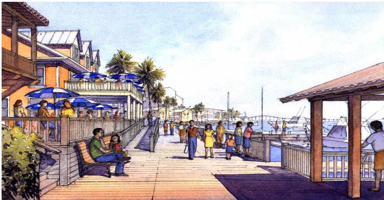
Schematic Showing Proposed Boardwalk

The revitalization of the Entertainment District has been identified by the City as a priority for many reasons, including economic development. The Form Based Code has developed conceptual designs of the Entertainment District that include a marina, new façade improvements to existing businesses, new development codes that address ingress/egress, setbacks, parking, sidewalks and other design features to entice visitors. A major component of this is the boardwalk. The proposed boardwalk will be 12' wide and be made of a recycled plastic material that closely resembles wood but does not deteriorate or splinter, thus increasing the life expectancy and decreasing the maintenance requirements. The boardwalk will be lit at night to increase usage and safety during the prime hours that people are enjoying the Entertainment District and will stretch from approximately Sunny Isle Drive to Swordfish Street, a distance of +/- 3,400 linear feet. The boardwalk will cantilever out over the bay and be constructed adjacent to a bulkhead and the proposed Marina (addressed elsewhere in this document). Permits from the General Land Office will be required.