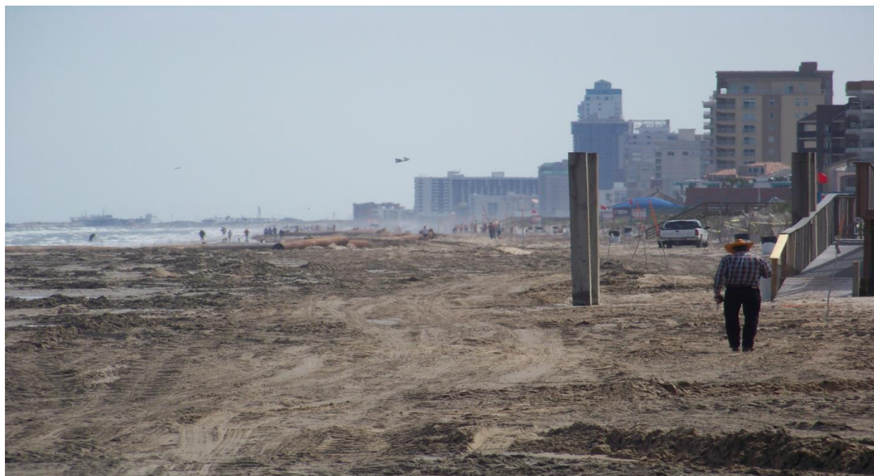
Re-nourishment from Dredge Material

The desired outcome of this project is to place a large amount of beach-quality sand onto the beaches and dunes of South Padre Island in an effort to widen the beaches, and strengthen and stabilize the dunes. By widening the beaches, more habitat for wildlife, such as nesting habitat for the endangered Kemps Ridley Sea Turtle and foraging habitat for the threatened Piping Plover, the Island is also being protected from erosion (erosion rate on the north end of the Island is five feet per year; on the south end; six to eight feet per year).