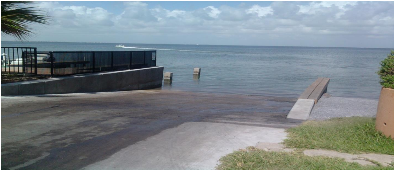
Recently completed Polaris Street Boat Ramp

Many of the East-West streets terminate on the west side at the Laguna Madre. Several of these have existing boat ramps that are used not only for launching boats but also other forms of personal watercraft such as jet-skis and kayaks. Recently Palm Street and Polaris Street boat ramps have been reconstructed.