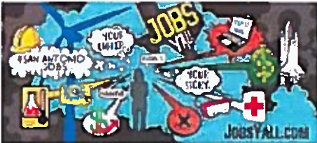
TWC bubble design 3.jpg 420K