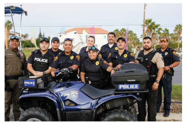
A few of SPI's finest during National Night Out.

We would also like to thank all of the businesses and groups that supported the event. Without your assistance none of this would have been possible.