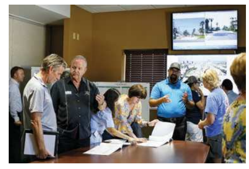
Community members and Staff discussing the project.

Thank you to the community members that attended!