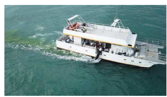
The green plume in the photo comes from the fluorescent dye that coats the sand grains.

Thank you to Partrac Ltd., United States Geological Survey, South Texas Program, Texas A&M University at Galveston and the United States Army Corps. Galveston District.