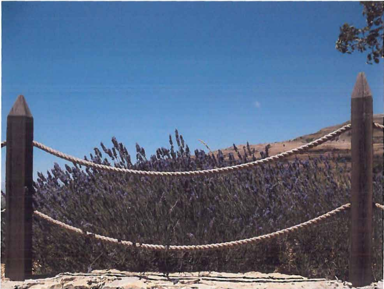
Sample rope fence we could construct around beach access walkways to discourage pedestrian traffic outside the walkway area.