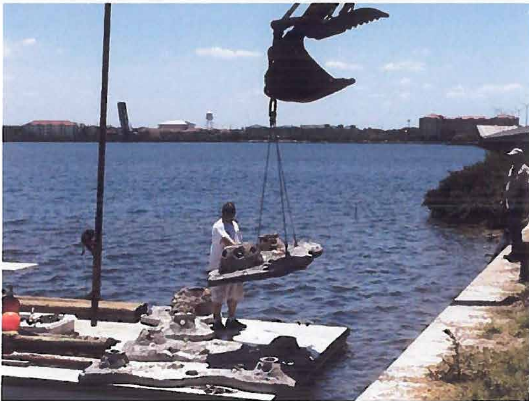
The city of Palmetto, FL repaired a damaged seawall and installed a 1,000 ft. living shoreline along a developed section of the Manatee River near Tampa.