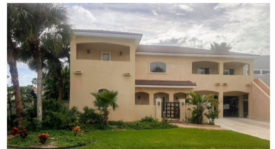
Yard of the month is 211 W. Campeche!

Use the SPI Election page to keep up to date on the Special Election.