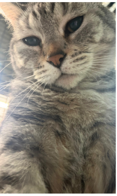
Friends of Animal Rescue

Boo-Boo (left) and Angie (right) were brought to Friends of Animal Rescue (FOAR) six months ago when their human died. They are older friendly cats that will fit in with cats and small dogs. Both are up to date on all vetting, friendly, and pretty laid back. The adoption fee is $25 for each of them. FOAR would like to keep them together but will consider adopting them out alone if needed. They are available or foster or adoption. Meet Boo-Boo a Angie at Friends of Animal Rescue, 4908 Padre Blvd, between 10-4. Ready to adopt? Complete our online application here.