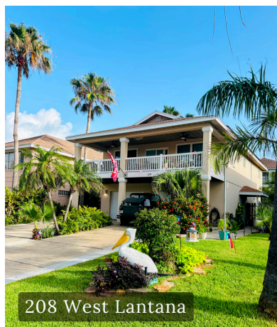
208 West Lantana