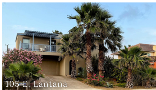
105 E. Lantana