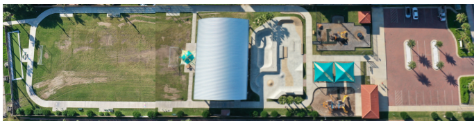
John L. Tompkins Park

South Padre isn't just home to great food and a beautiful beach, there are also several parks to visit. To view more on our parks click here!