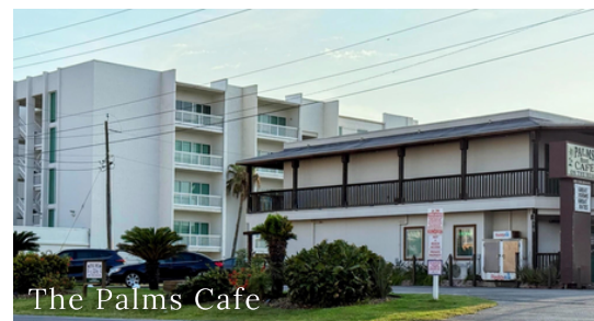
The Palms Cafe

Congratulations to 105 E. Lantana and The Palms Cafe for being May's yard and landscape of the month!