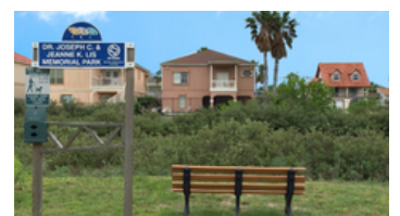
Lis Memorial Park.