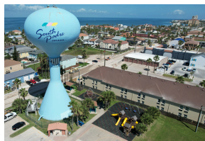
Water Tower Park