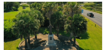
Queen Isabella Memorial Park