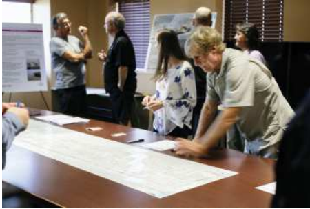
Thank you to the community members for attending!

The City of South Padre Island held an open house meeting for the Drainage Master Plan on Wednesday, Aug. 1. The Community Drainage Survey has been launched.