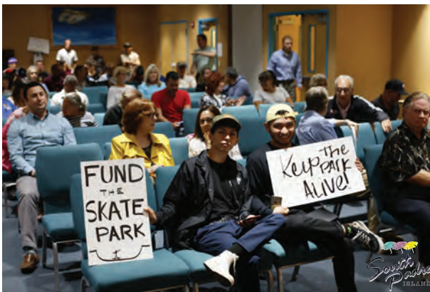
Skatepark supporters at City Council meeting.