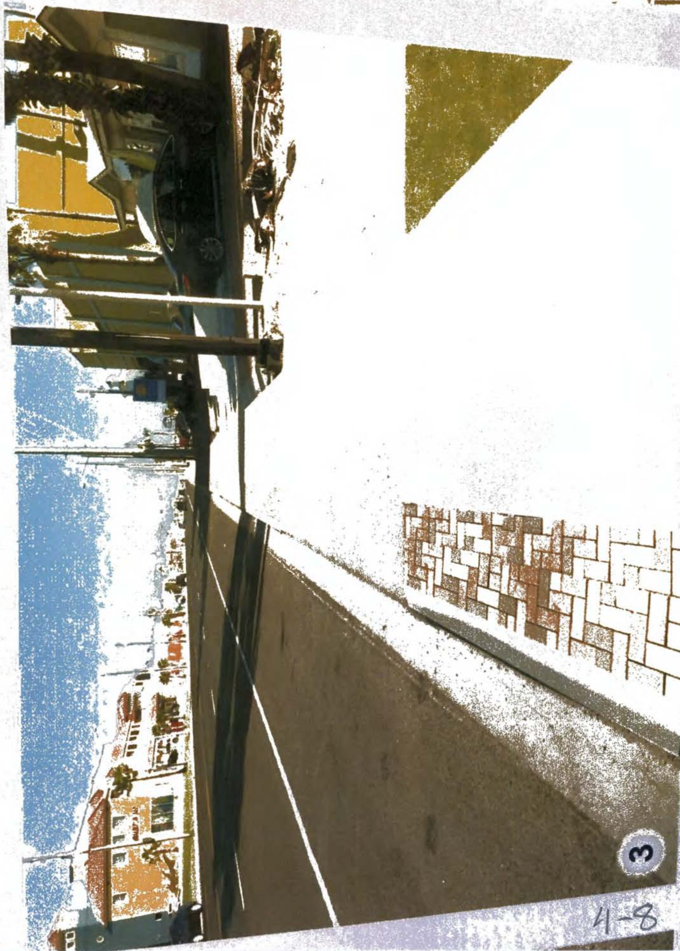
Proposed 6' Sidewalk w/ 2' Decorative Paving