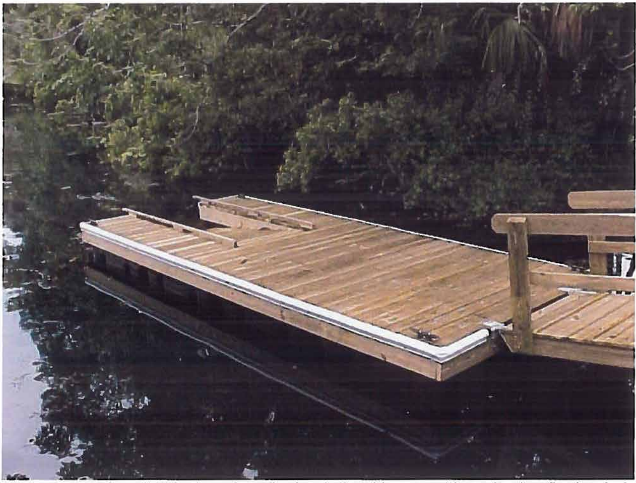
There are tons of possibilities here, from floating docks with a ramp (shown here) to floating docks attached to pilings, to solid docks, to simple ramps. More discussion to follow soon.