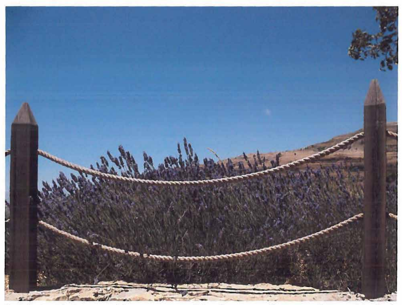
Sample rope fence we could construct around beach access walkways to discourage pedestrian traffic outside the walkway area.