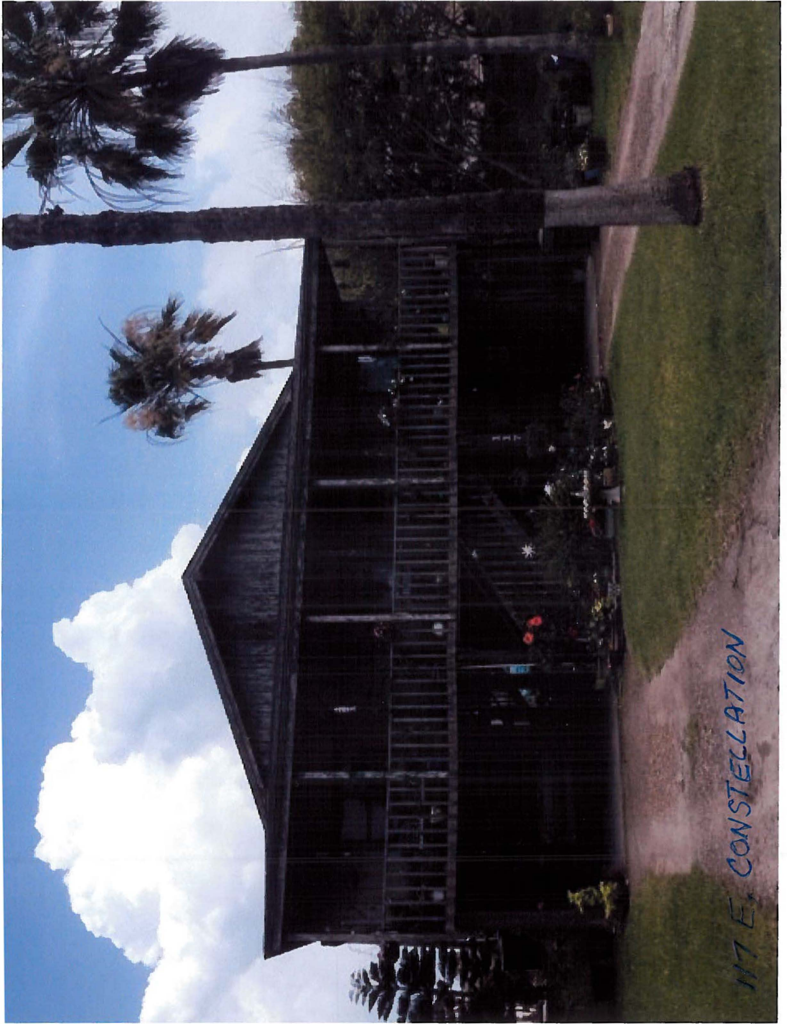
117 E, CONSTELLATION