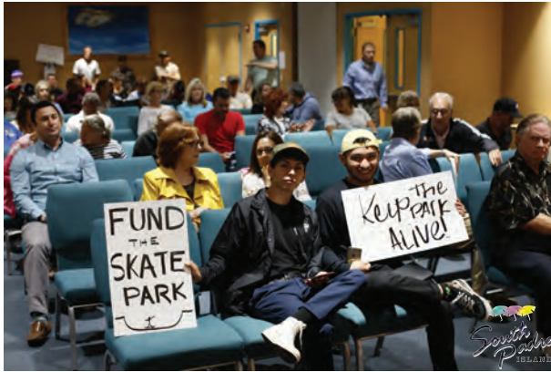
Skatepark supporters at City Council meeting.